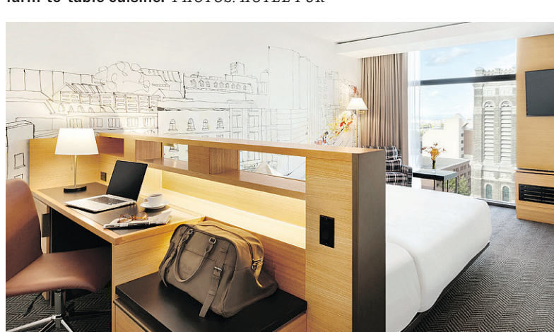
Hôtel PUR's $11-million makeover included its 242 guest rooms and suites.

cream, caramelized pecans and spiced maple syrup; or waffles with chocolate-mascarpone mousse and strawberries.