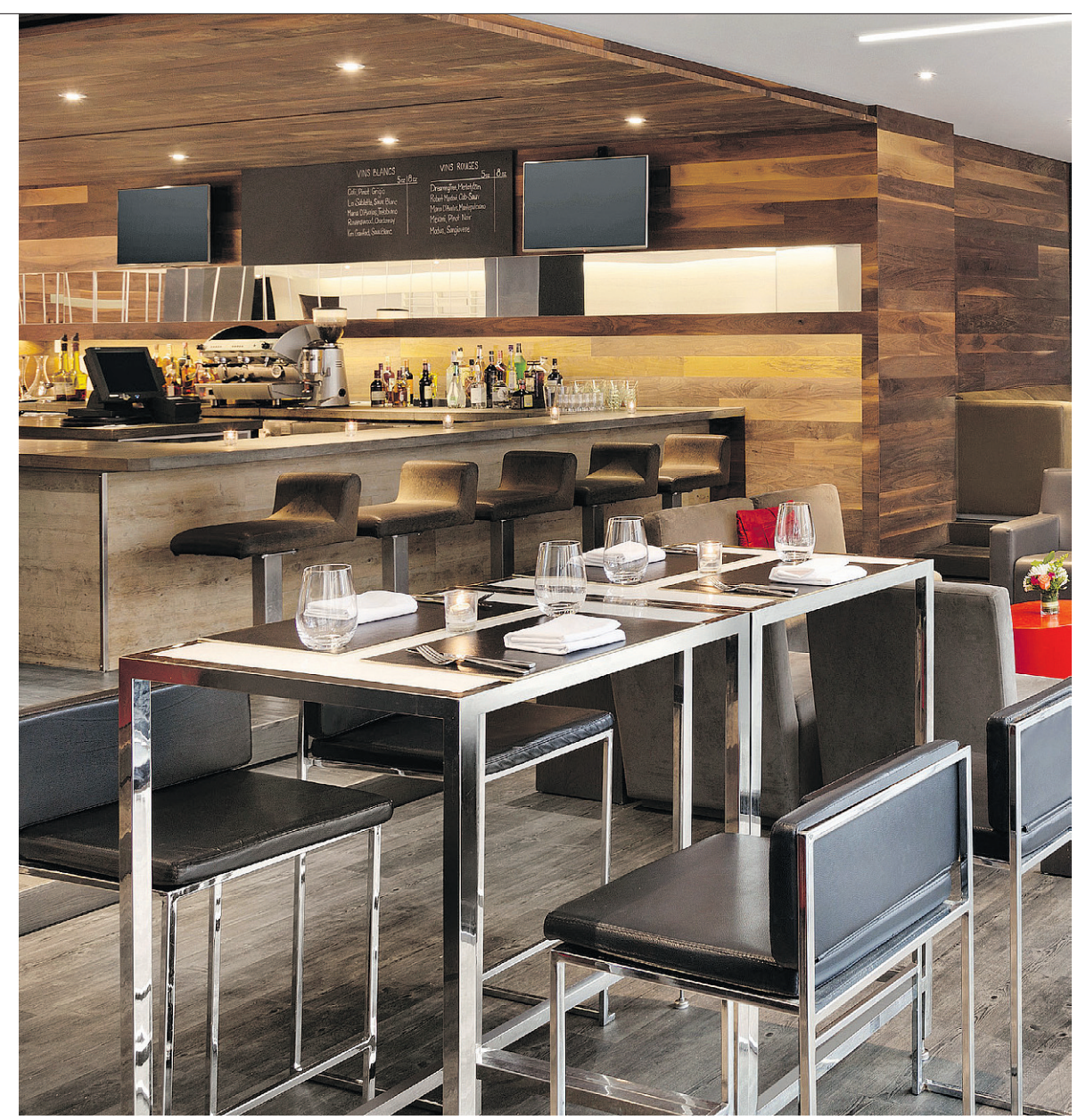
Table, an innovative gourmet restaurant in Quebec City's Hôtel PUR in the St-Roch district, serves excellent farm-to-table cuisine.

Breakfast is an indulgence, featuring such dishes as crêpes with brown sugar, apple butter, sour